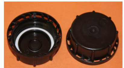
Vented cap Not shown